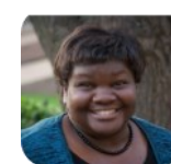
Vernetta Eddleman Social Ministries