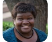
Vernetta Eddleman Social Ministries