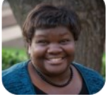
Vernetta Eddleman Social Ministries