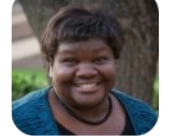
Vernetta Eddleman Social Ministries