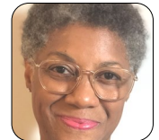
Charlotte Johnson Missions